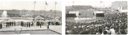
An aerial photo (above) of the celebratory event on the opening day.

Opening of the Ishibashi Cultural Hall / Ishibashi Cultural Auditorium.