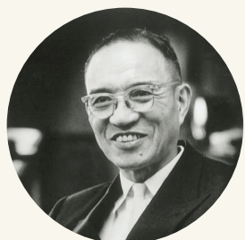
ISHIBASHI Shojiro (1889-1976)

As you look at the displays, try asking yourself: "How did Shojiro feel when he did this?"